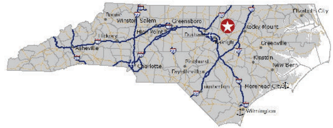
State Map of 566 Airport Rd.